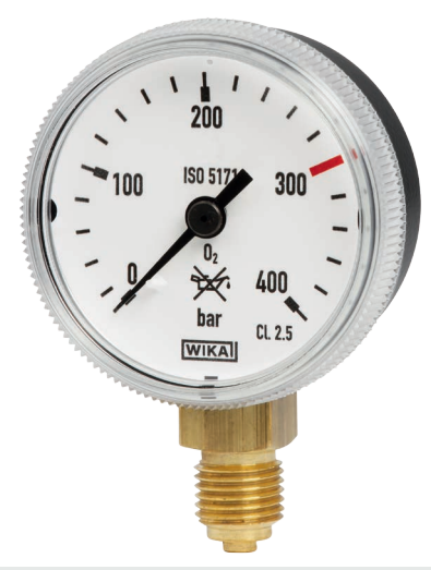
Bourdon tube pressure gauge model 111.31